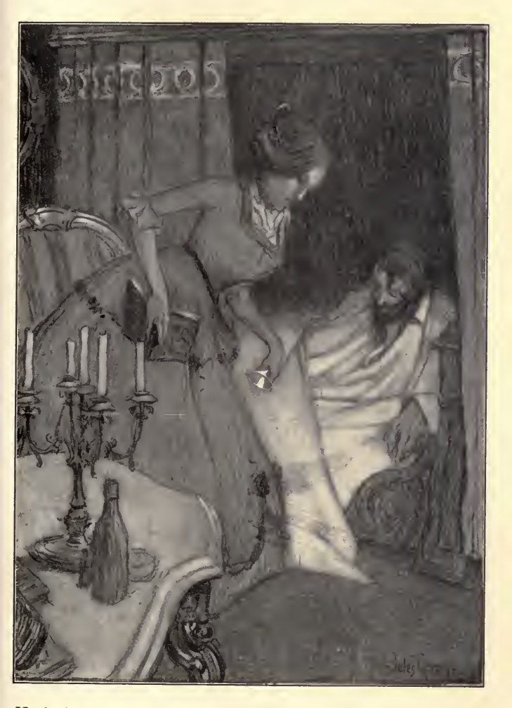
He looked at her a moment, which seemed to her an age, and simply replied, "I understand it."